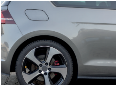
L001 BRAKE CLEANER